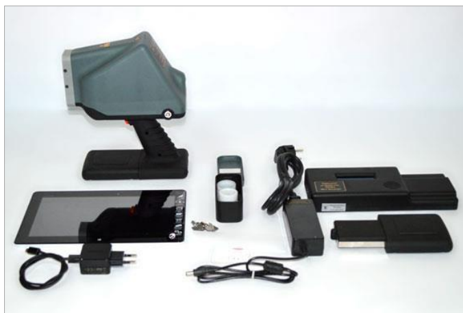
Contents of delivery of MetXpert XRFA