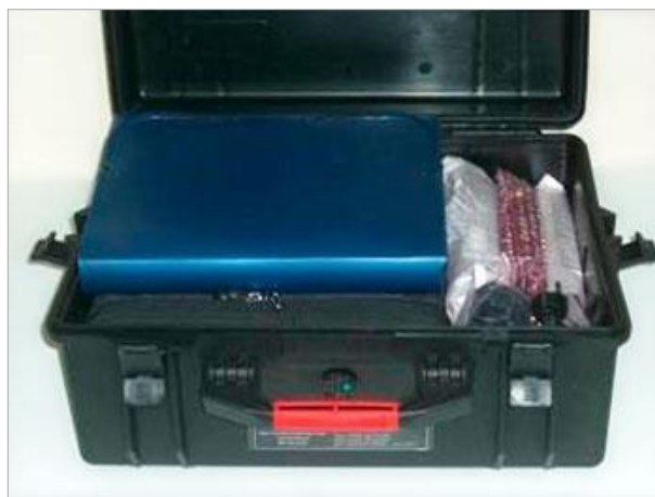
Packed in sealed plastic case